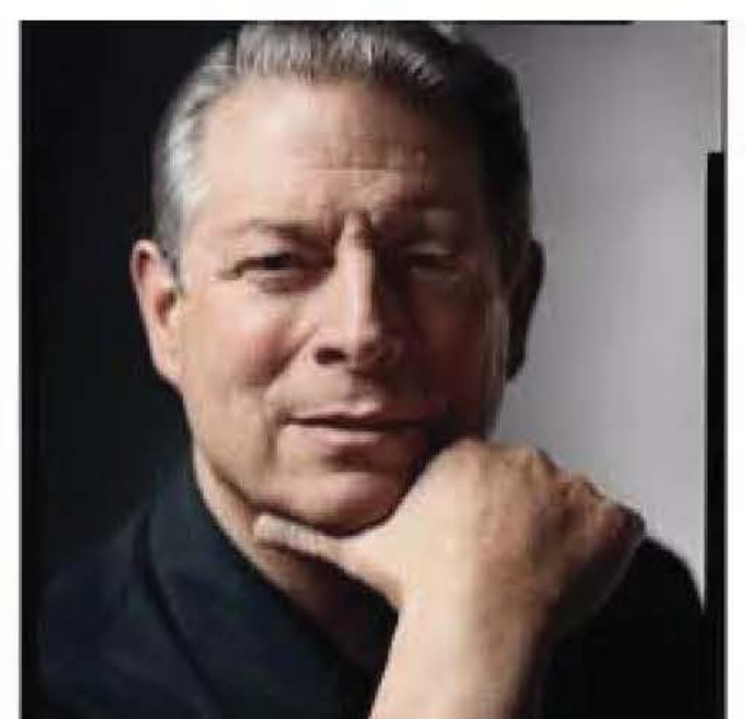
Vice President Al Gore Founder & Chairman of The Climate Reality Project