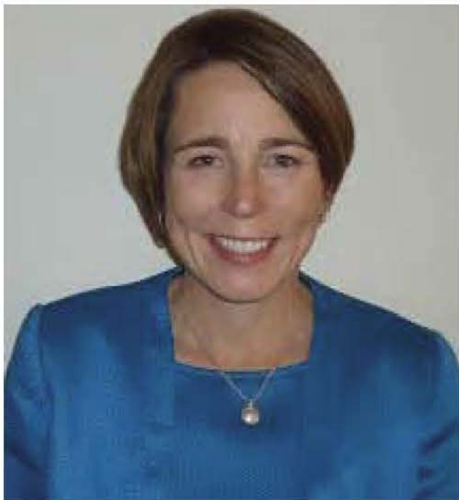
AG Maura (MOOR-ah) Healey Massachusetts