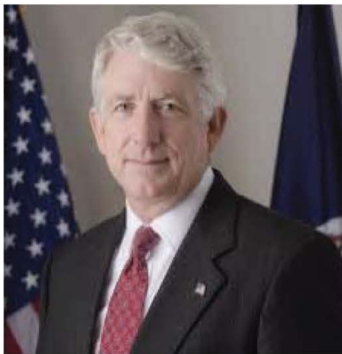
AG Mark Herring Virginia